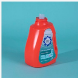
Plastic detergent bottles