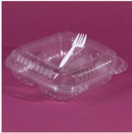
Plastic takeout containers and utensils