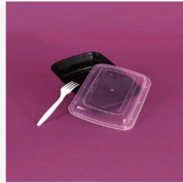
Plastic takeout containers and utensils