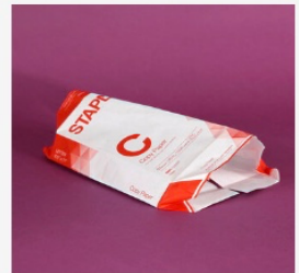
Packaging for printer paper