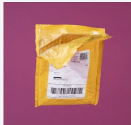
Envelopes with bubble wrap inside