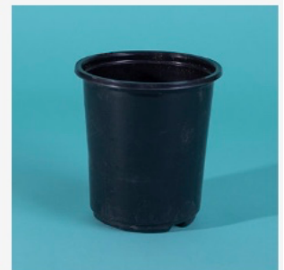
Plastic plant pots (4" diameter or more)