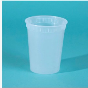
Plastic round containers (6 oz or more)