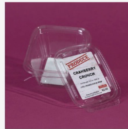
Plastic food containers that open with a pull tab