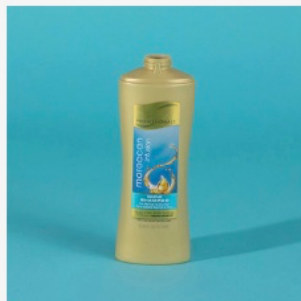
Plastic personal care product bottles (6 oz or more)