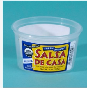
Plastic round containers (6 oz or more)