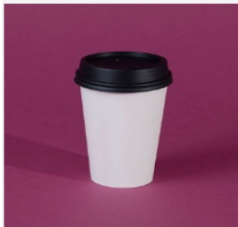
Hot drink cups (clean or dirty)