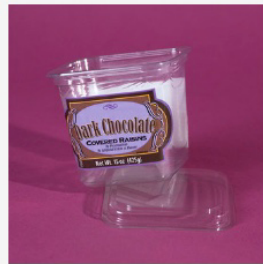
Square plastic snack containers