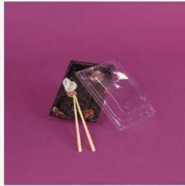
Plastic takeout containers and chopsticks