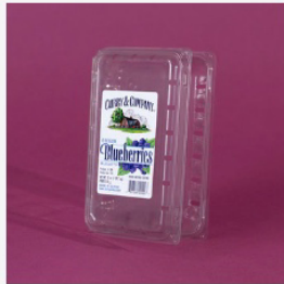
Plastic produce containers (for berries, herbs, etc.)