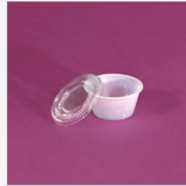
Plastic condiment cups