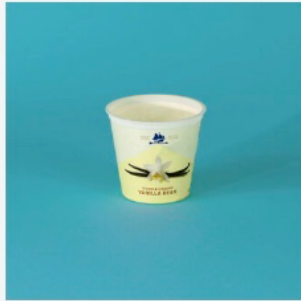
Plastic round containers (6 oz or more)