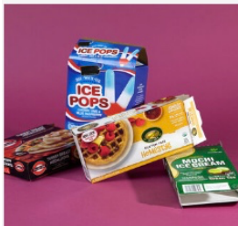
Frozen food boxes (for ice cream, microwave dinners, etc)