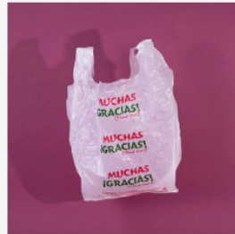
Plastic shopping bags