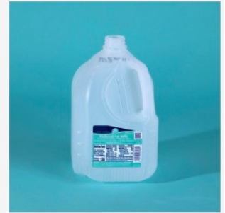
Plastic gallon jugs (for milk, juice, etc.)