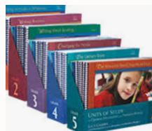
Lucy Caulkins Unit of Study