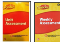
Soft Cover Assessment Books