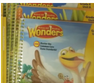
Spiral Soft Cover